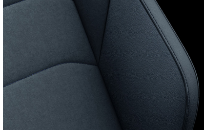
"R-Line ArtVelours Microfleece/Vienna" cloth & leather Titan Black (OH) Standard on R-Line models