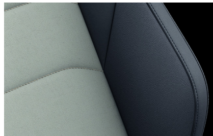
"ArtVelours Microfleece/Vienna" cloth & leather Mistral/Raven (YS) Optional on Elegance models