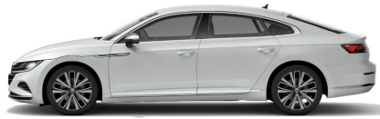
Oryx White Pearl Effect**