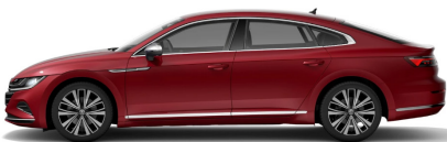
Kings Red Metallic*1